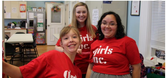
Each year, Girls Inc. works with great Americorp leaders.