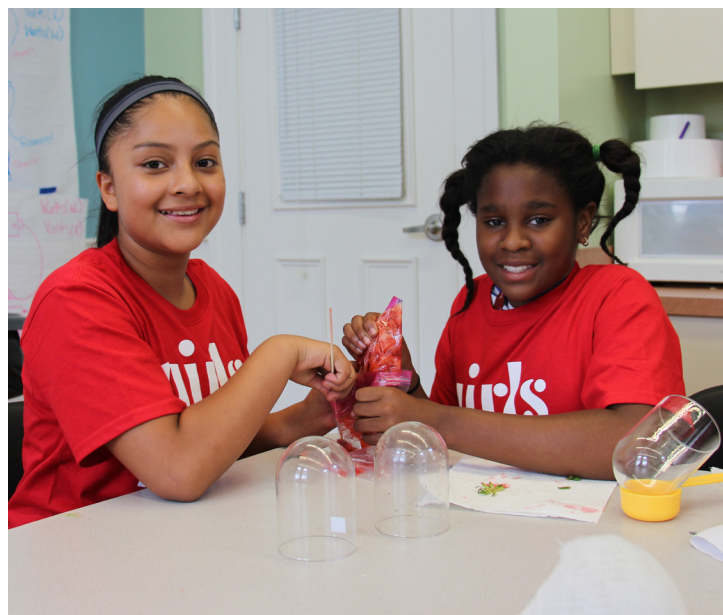
Eureka! Program —fostering an interest of science, technology, engineering and math.

Stem-literacy and mentoring are major components of the Middle School Programs: Odyssey , and Eureka! . Girls Inc. continues the process of building self-esteem, self-awareness and leadership skills to further their chances for a successful high school career leading to post-secondary education.