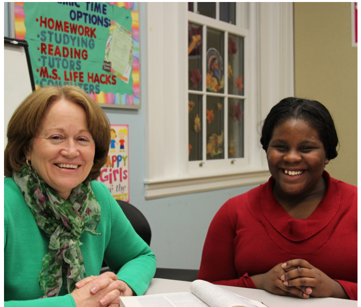
Teens have access to academic workshops, tutoring, computers, and adult mentors.

100% OF OUR TEENS WENT ON TO COLLEGE RECEIVING OVER $800,000 IN SCHOLARSHIPS