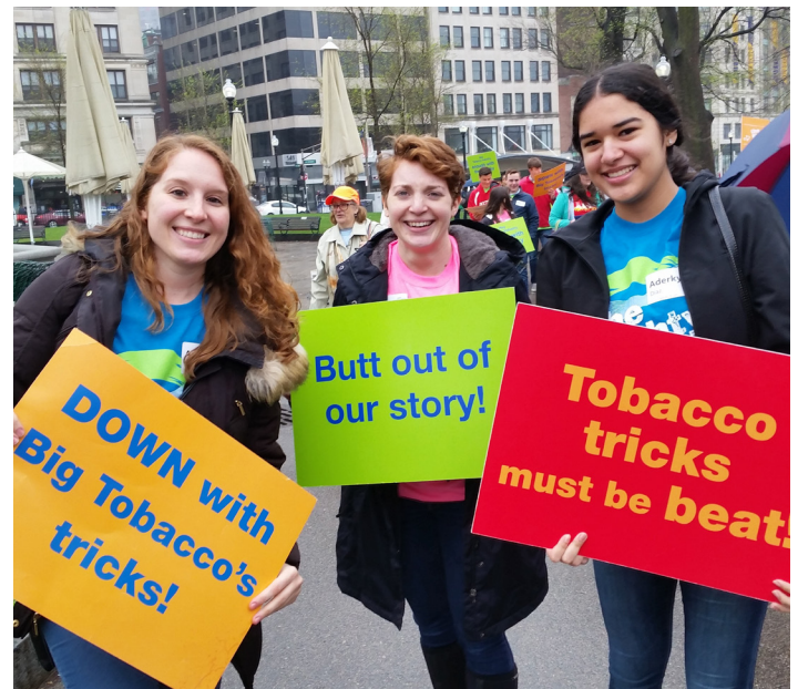
POS (Part of the Solution) girls advocated for youth across Lynn and successfully had legislation passed in Lynn to limit the number of tobacco licenses for convenient stores and raised the legal age from 18 to 21 in which you can buy tobacco products.

Through our high-expectation year-round programming, Girls Inc. provides opportunities for girls to assume more leadership roles at Girls Inc. of Lynn and within their communities.