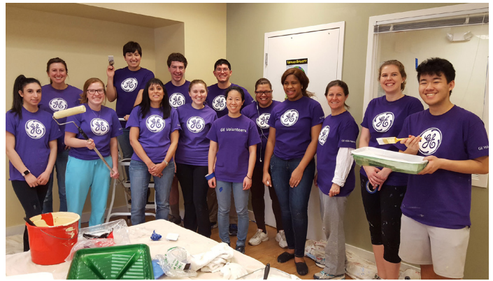
GE Aviation Paint

344 volunteers providing 3274 hours of service!