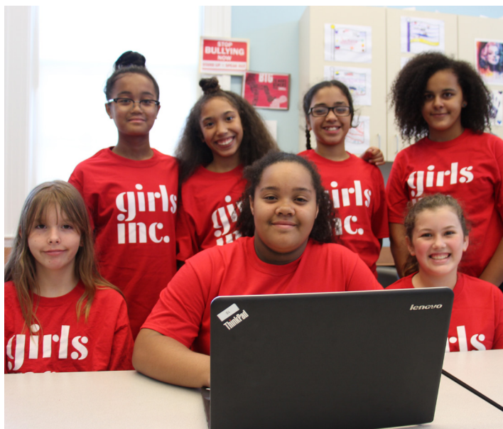
Partners such as Google's " Made with Code " work with Girls Inc. to promote a strong understanding of the web, social media, and encourage internet safety.

Programs at Girls Inc. of Lynn are holistic, compensatory, intentional, and focused on the individual needs of girls, providing a wide variety of high-impact opportunities that low-income girls might not otherwise experience.