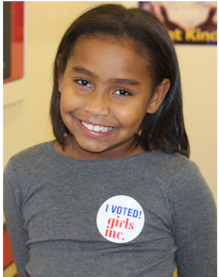
Girls learn to vote during a mock election.

SCHOOL AGE CHILDCARE is a year-round licensed program for girls ages 5–12 offering high quality academic and educational activities. Girls enjoy an environment that takes girls seriously, provides literacy skills, develops new abilities, asks questions and explores. Our literacy program for ages 5–8 is the centerpiece. Here girls are encouraged to read and discuss books, planting the seeds for a life-long love of literacy and learning. Our literacy program is being replicated and launched through-out the Girls Inc. affiliates across the US.