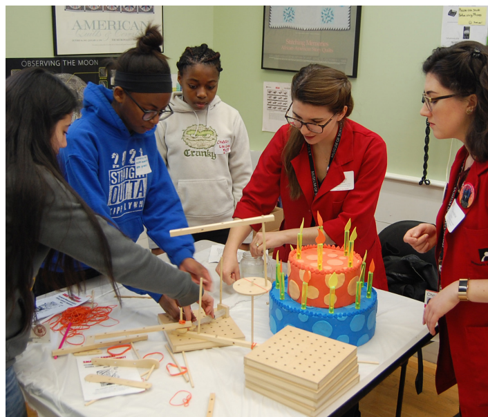
Smart Girl Summit 2017 —each year 125 Middle School girls come together at Girls Inc. for a day of STEM workshops taught by women in STEM professions.